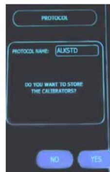
Figure 2. ALKSTD / Alkenal store calibrators screen shot