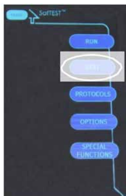
Figure 3. Home Screen Shot