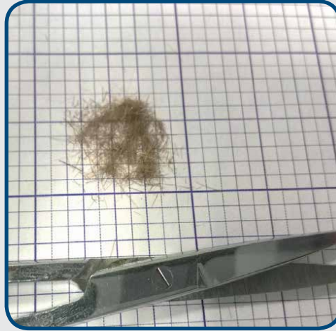
Standard Method (Chopped Hair)

More effective results for downstream applications